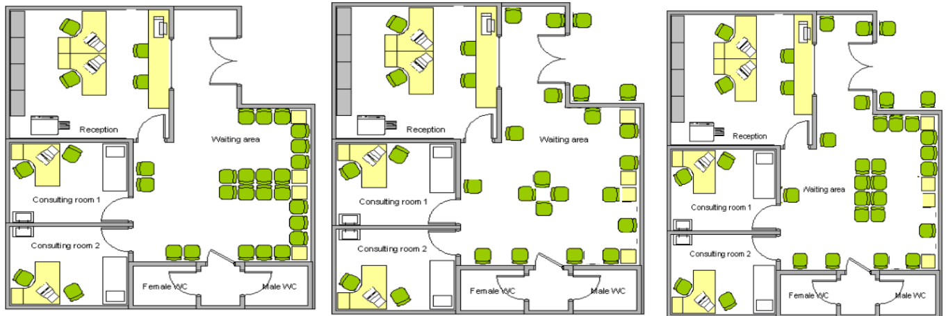
Seats spaced only for ILI (27 chairs):