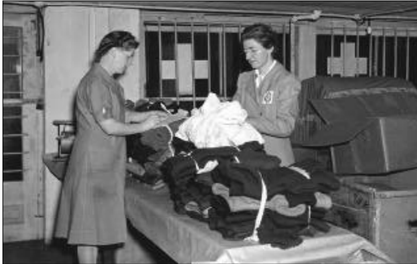
World War II Red Cross Workers