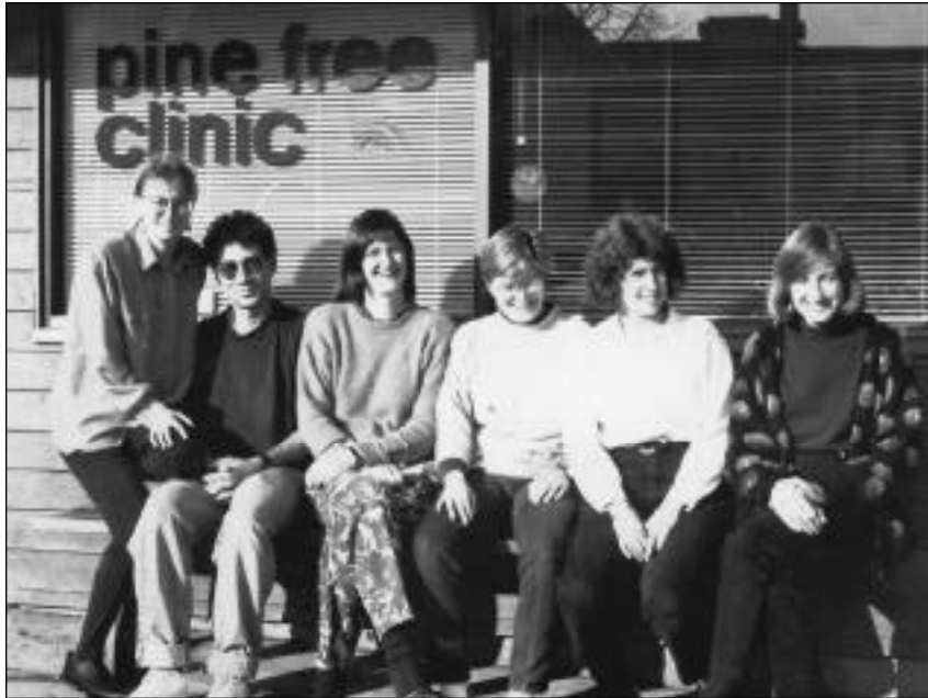
Pine Street Clinic

limited because, although no hospital was required to have a Therapeutic Abortion Committee, this was the only legal route available for terminating an unwanted pregnancy.