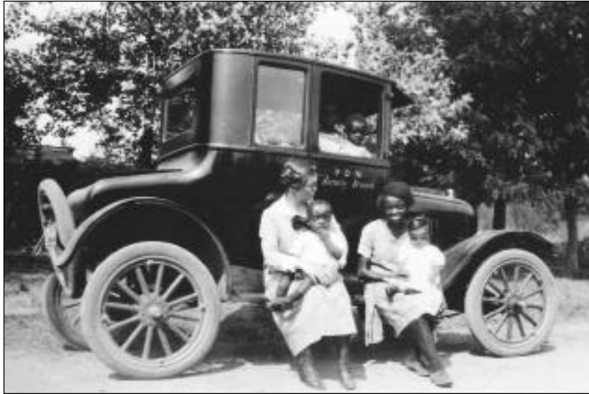
Two VONs sitting on a car's running board with children.