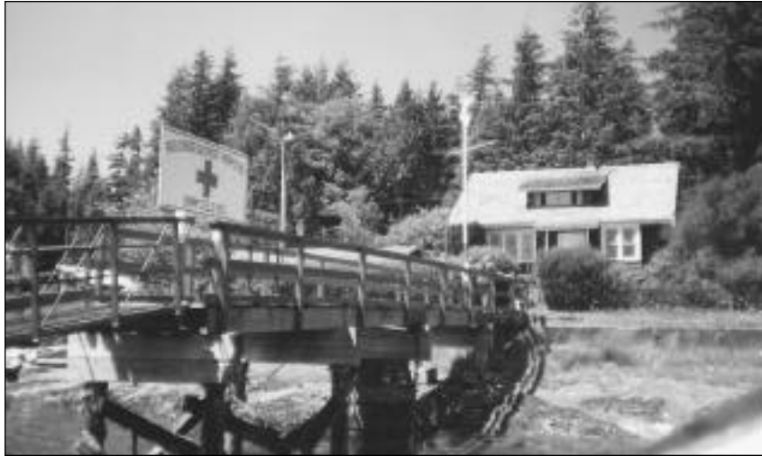
Red Cross Cottage Hospital at Bamfield